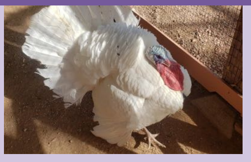
Our newest resident, Sufi the turkey, arrived in time to welcome everyone to our all-vegan Thanksgiving. For more about Sufi, scroll down to Recent Activities.